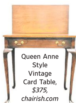
Queen Anne Style Vintage Card Table, $375, chairish.com

SHAPE SHIFTERS / THREE VINTAGE GAME TABLES TO PLAY WITH