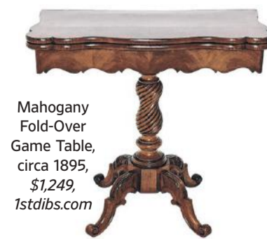
Mahogany Fold-Over Game Table, circa 1895, $1,249, 1stdibs.com