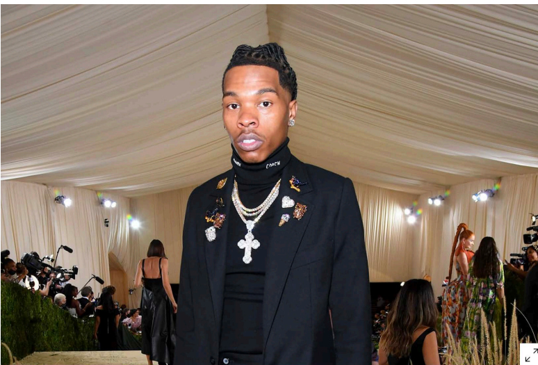
5 of 6 • Rapper Lil Baby wears custom crystal brooches by A-Morir Studio to the Met Gala 2021