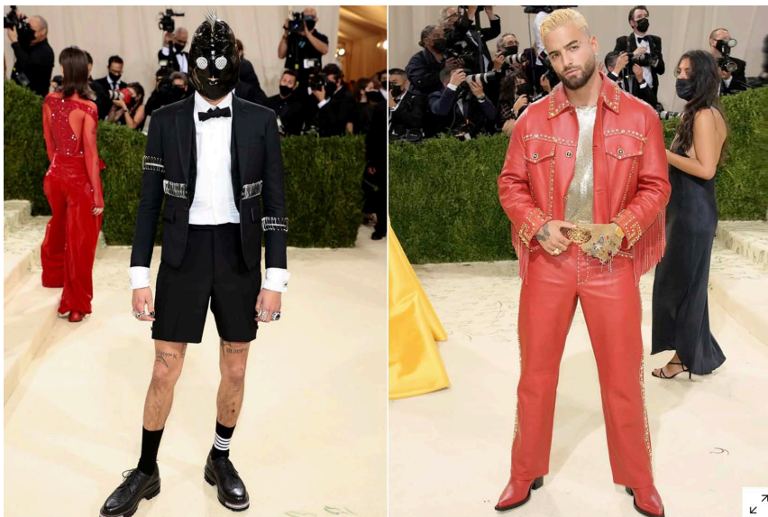
3 of 3 • Model Evan Mock wears gemstone and diamond rings and singer Maluma wears an Aslan gold glove and Maria Tash earrings to the Met Gala 2021