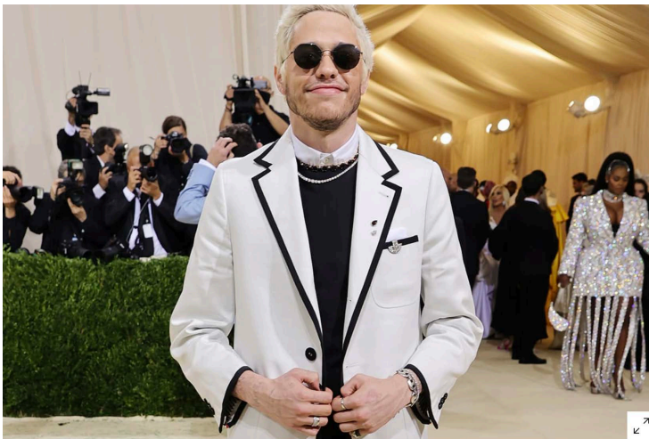
1 of 3 • Comedian Pete Davidson at the Met Gala 2021 wearing Fred Leighton and Kwiat jewellery

In a previous article, I wrote about the fashion of wearing several mismatched rings together. And if this questionable trend was initially more noticeable among women, now it has moved on to men. Its great admirer is Timothée Chalamet, whose fingers were manifestly adorned with several Cartier rings at both the Cannes and Venice film festivals, and at the Met Gala this trend was followed by Shawn Mendes and Pete Davidson. Some musicians and actors have remained faithful to the tendency to wear just a single ring, but a large one and often with a stone in the centre. For example, American musician Finneas O'Connell wore a Cartier gold panther ring, and Pharrell Williams wore a ring with a large yellow diamond.