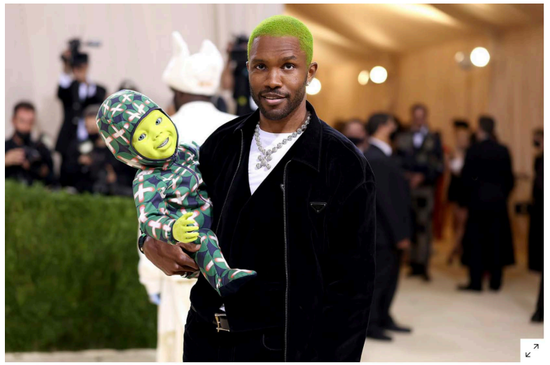
4 of 8 • Singer Frank Ocean wears a Homer diamond necklace to the Met Gala 2021