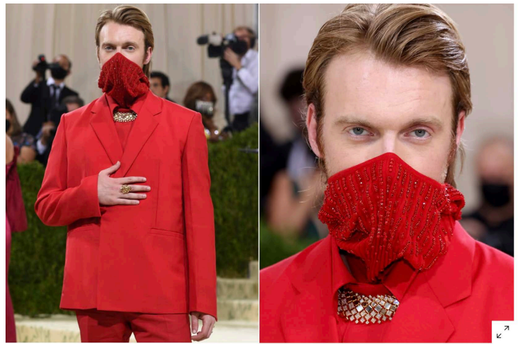
2 of 3 • Finneas O'Connell wears a Cartier Panther ring and a Cartier [Sur] Naturel necklace to the Met Gala 2021