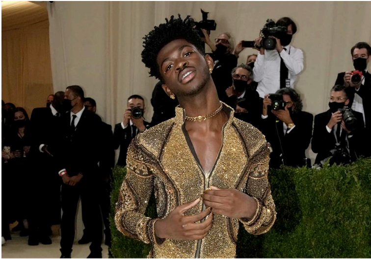
1 of 8 • Rapper Lil Nas X at the Met Gala 2021 wearing a gold chain choker