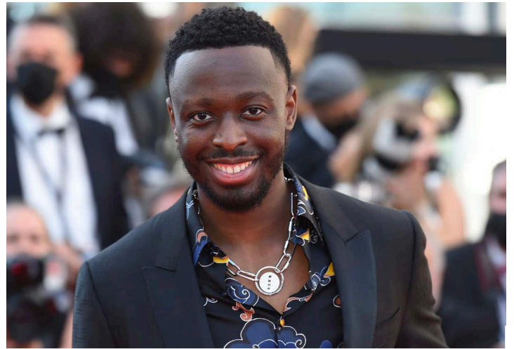
6 of 8 • Singer Dajou wears Messika to the Cannes Film Festival 2021