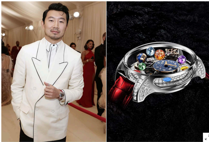
1 of 2 • Actor Simu Liu wears the Jacob & Co. Astronomia Solar Baguette watch to the Met Gala 2021

Finally, I would like to draw your attention to those who chose to wear watches. Classic timepieces are quite a well-established phenomenon on a man's wrist, but this year just blew my mind with all the bright, unique models on show. If up to this point you have never dared to wear a mini-galaxy made of precious stones or a miniature painting made of enamel – go for it, your time has come! This new trend already has the support of actor Simu Liu who was spotted wearing the Astronomia Solar Baguette watch by Jacob & Co. Elsewhere, Swizz Beatz was pictured wearing the Midnight Poetic Wish timepiece by Van Cleef & Arpels, which displays a romantic landscape with shooting stars over a Parisian sky, and the renowned stylist and publicist Law Roach has been seen wearing the Big Bang Unico Rainbow King Gold watch by Hublot