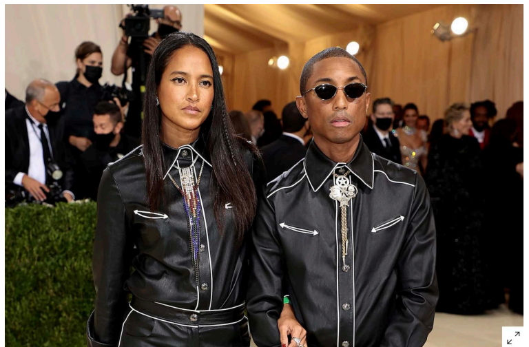
8 of 8 • Helen Lasichanh and Pharrell Williams, wearing a Richard Mille watch, at the Met Gala 2021