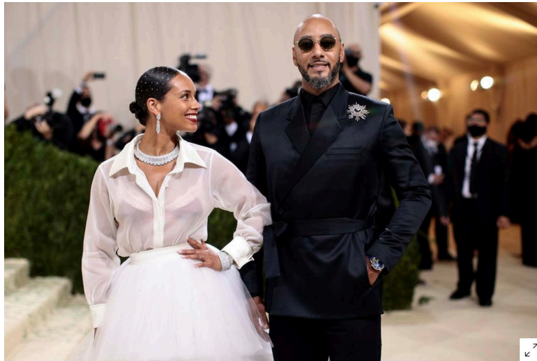
6 of 6 • Record producer Swizz Beatz wears a Dior & Peter Doig brooch to the Met Gala 2021 alongside his wife Alicia Keys