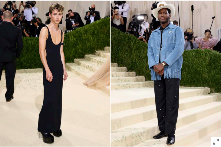
5 of 8 • Actor Troye Sivan wears a Cartier diamond necklace and singer Leon Bridges wears Panthère de Cartier jewellery to the Met Gala 2021