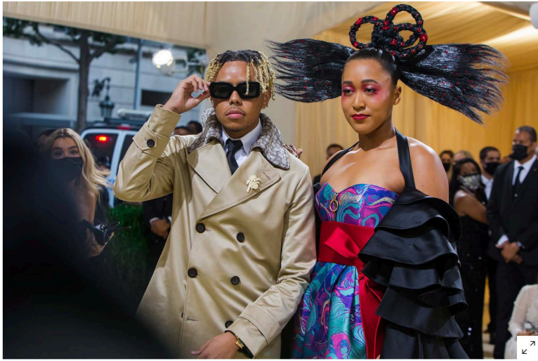
1 of 6 • Tennis player Naomi Osaka and her partner, singer Cordae wearing a floral brooch at the Met Gala 2021