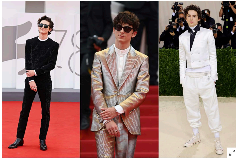
2 of 2 • Timothée Chalamet is a men's jewellery trend-setter having been seen wearing brooches and rings, typically by Cartier

In 2021, three men's trends really stood out: wearing a variety of necklaces, several rings at the same time, and large brooches (again sometimes two or three at a time). It's safe to say that this year's dazzling jewellery looks were preceded by a more muted style, usually limited to a brooch on a jacket lapel or a pearl necklace. But the thirst for self-expression and being seen again in public after the pandemic has made male actors, singers and public figures generally more daring in their jewellery choices.