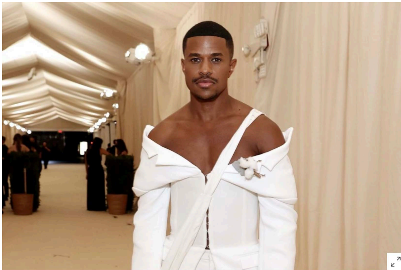
4 of 6 • American theatre actor Jeremy Pope in a floral brooch at the Met Gala 2021