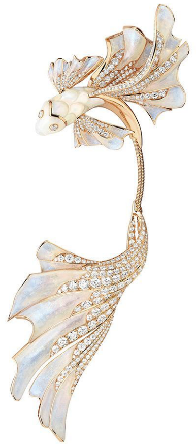
French actor Nicolas Maury wears the Opalescence brooch, set with a 71.69 carat oval cabochon, and the Opalescence pendant earring set with opals and diamonds from the Boucheron Holographique High Jewellery collection