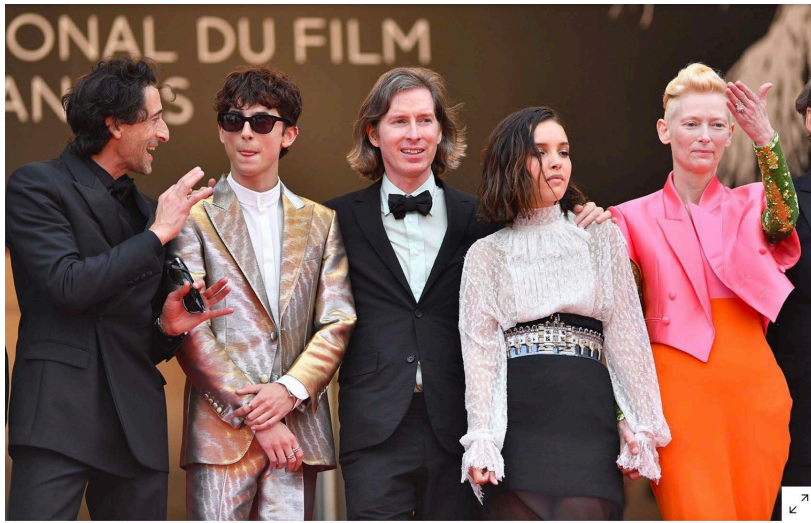
1 of 2 • Timothée Chalamet at the Cannes Film Festival 2021 wearing a selection of Cartier rings and bracelets