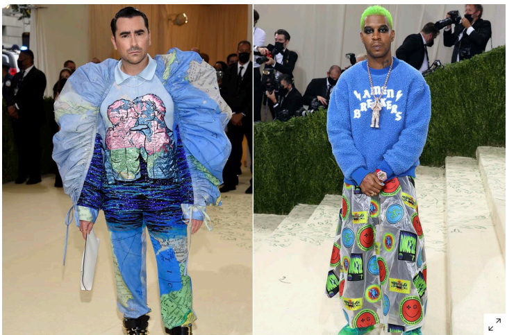
7 of 8 • Actor Dan Levy wears a diamond line necklace and rapper Kid Cudi wears a Ben Baller x KAWS 'Space' astronaut necklace to the Met Gala 2021