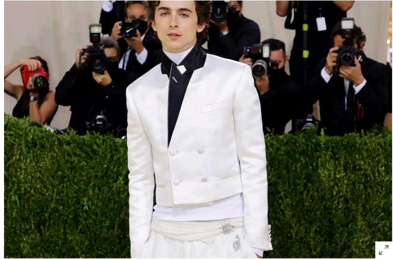
2 of 6 • Actor Timothée Chalamet wears two Cartier brooches at the Met Gala 2021