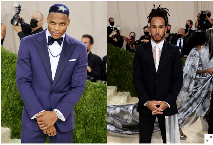
3 of 8 • Basketball player Russel Westbrook wears a Greg Yüna sapphire and diamond necklace and F1 driver Lewis Hamilton wears a pearl necklace to the Met Gala 2021