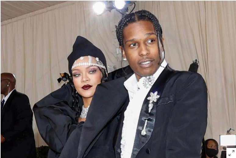
3 of 6 • Rapper A$AP Rocky wears a jabot pin from Lan Antiques to the Met Gala 2021 alongside his partner, Rihanna