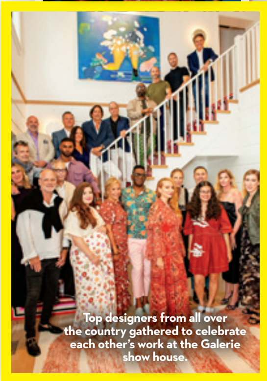
Top designers from all over the country gathered to celebrate each other's work at the Galerie show house.

A GREAT SHOWING! VIPS CAME OUT TO THE 2021 GALERIE HOUSE OF ART AND DESIGN PREVIEW EVENT