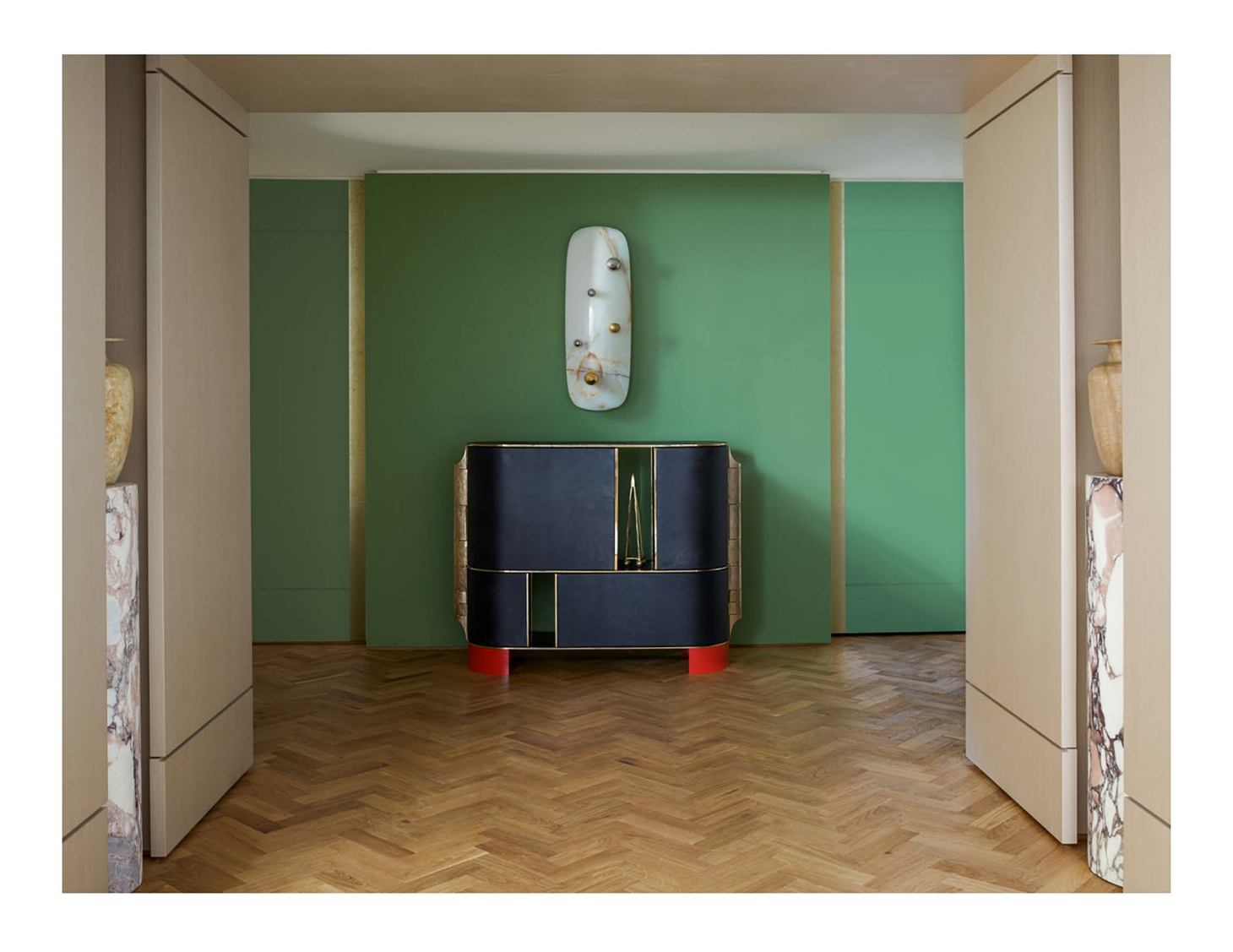
"My choice of materials is always intentional"

Salvagni took this opportunity to look for a bigger space, where he could introduce new concepts in addition to his permanent collection of works. Once he found the perfect location, Salvagni started to completely reimagine it. "To turn it into the kind of dreamy escape we envisioned, we had to strip it all the way back to its raw shell and start again," he confesses. "From an architect's point of view, it was somewhat of a challenge – uneven flooring, crooked walls, and intrusive build outs...After a sixmonth-delay [due to the coronavirus outbreak], we were able to create the jewel-like space I had in mind."