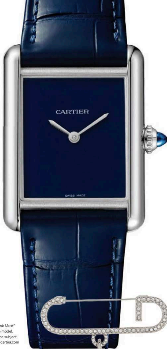
Cartier "Tank Must" watch, large model. $2,860 (price subject to change); cartier.com