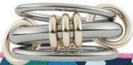
Spinelli Kilcollin "Gemini BG" ring. $5,600; spinellikilcollin.com