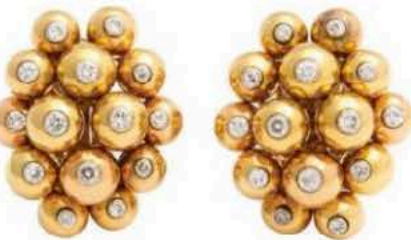
Cartier 1950s gold and diamond cluster earrings, $62,500; alvr.com