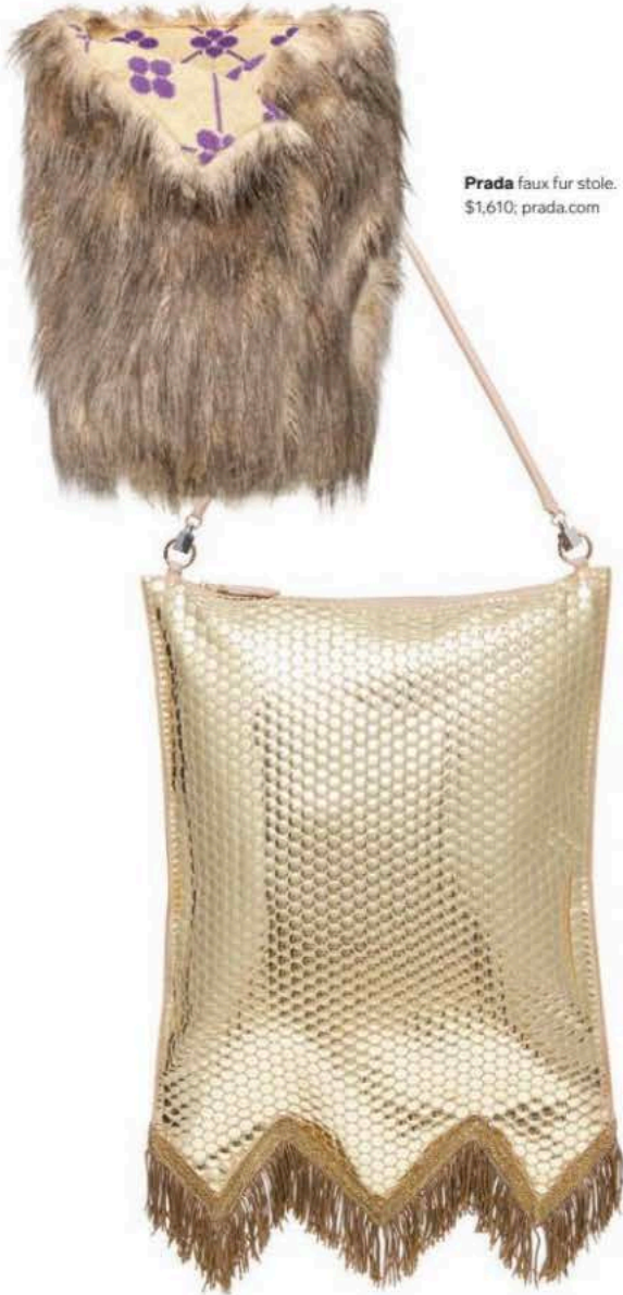
Prada faux fur stole. $1,610; prada.com