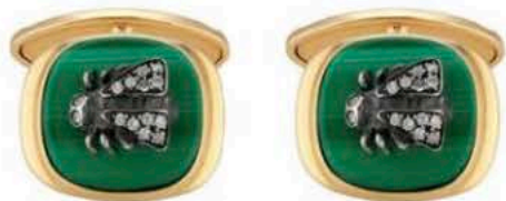
Gucci 18-karat gold "Le Marché des Merveilles" cuff links. $3,200; gucci.com