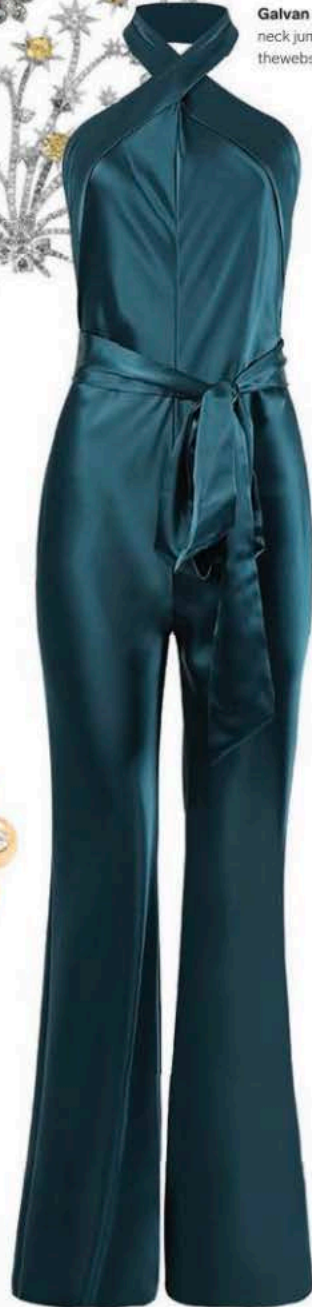
Galvan "Eve" halter- neck jumpsuit, $1,495; thewebster.us