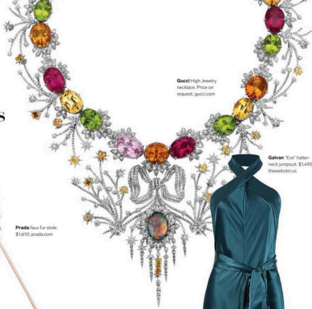
Gucci High Jewelry necklace. Price on request; gucci.com