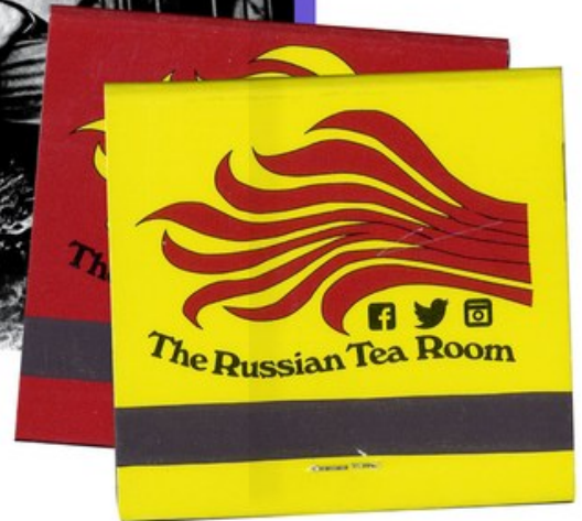
Central Park, Breakfast at Tiffany's movie still, and The Russian Tea room. From Getty Images (Central Park); From the Everett Collection ( Breakfast at Tiffany's ); Courtesy of The Russian Tea Room (Matchbooks).