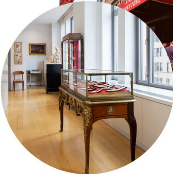
Choupette and A La Vieille Russie.