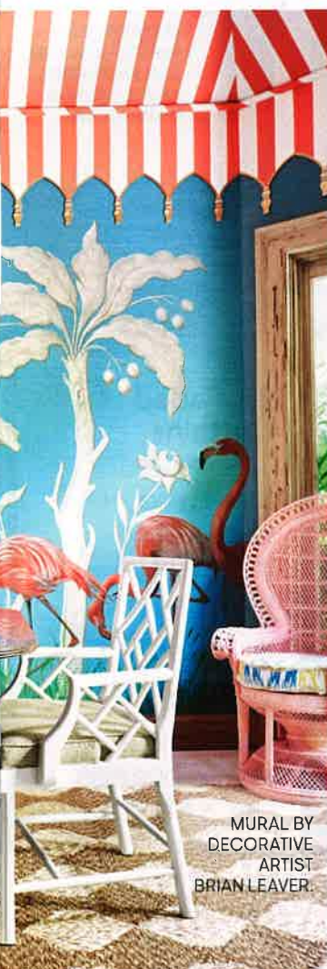
MURAL BY DECORATIVE ARTIST BRIAN LEAVER.

“I wanted to create uniformity in this library with wood paneling, so we painted the books two shades of blue.” —Kelley Proxmire