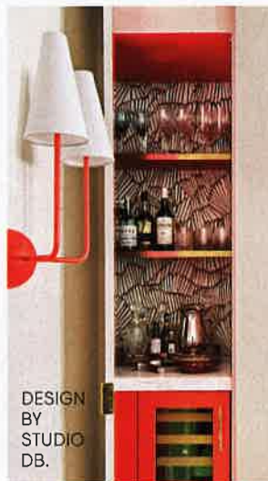
DESIGN BY STUDIO DB.