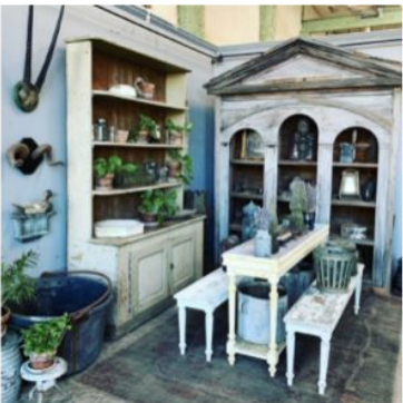
Milne Antiques and Design; Kingston, NY