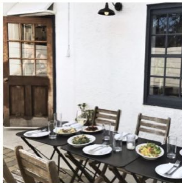
Canoe Hill; Millbrook, NY