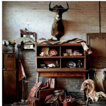
Maison Bergogne; Narrowsburg, NY