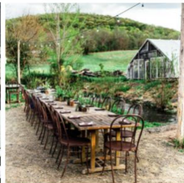
Blue Hill at Stone Barns; Tarrytown, NY