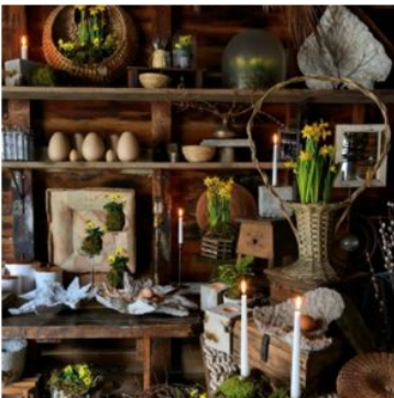
Hort and Pot; Oak Hill, NY