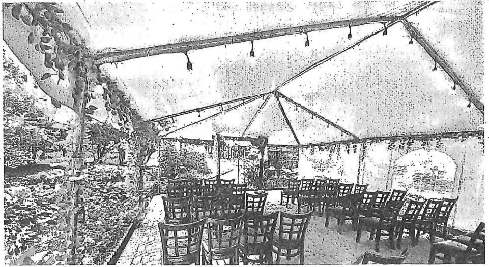
Traditions 118 in Granite Springs, set up for an outdoor wedding.