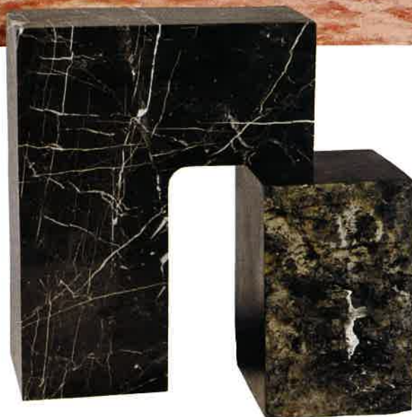
Right: Found II Side Table No. 1 by Dumlu Ozcan / aspacestudio.com Page 158