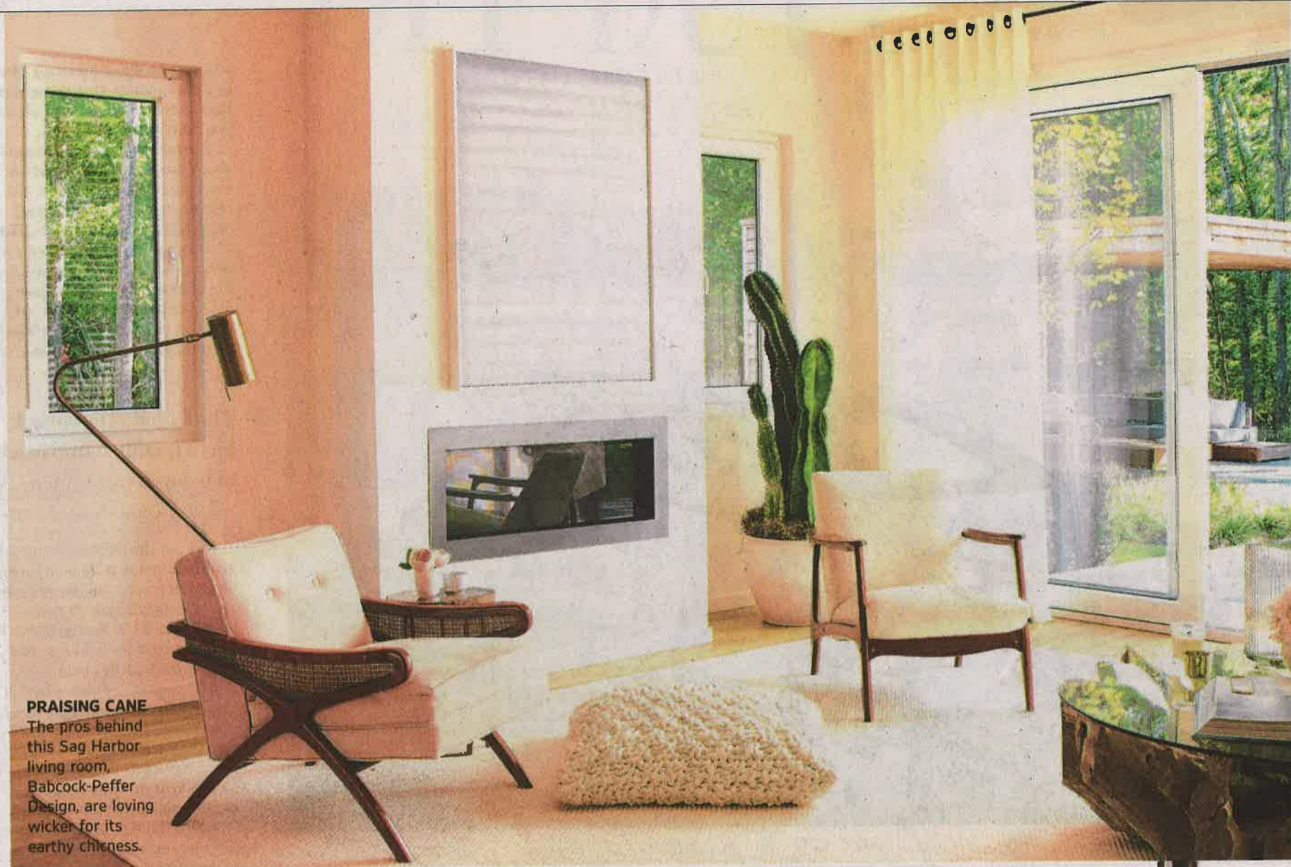
PRAISING CANE The pros behind this Sag Harbor living room, Babcock-Peffer Design, are loving wicker for its earthy chicness.