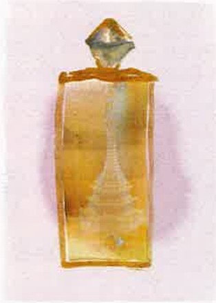
Gold, crystal and mother-of-pearl sculpture, date unknown. "This is a tiny pagoda enveloped in gold, most likely from Thailand. I bought it at an antique shop decades ago. It feels very powerful to me."