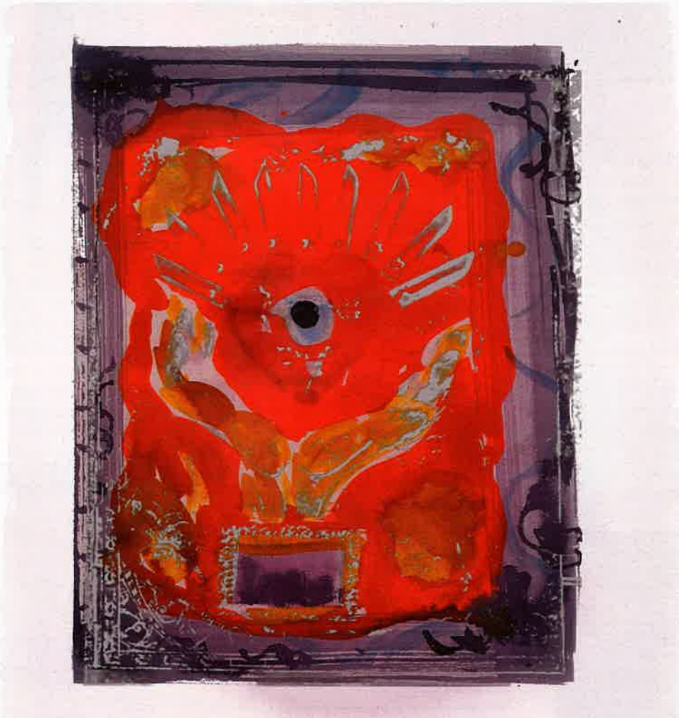
Clasped diary affixed with crystals, a glass eye and a mirror, 2019. "This is a creation by my friend Fidji Simo — a clasped diary encrusted with crystals, a small mirror and a glass eye — which I keep in my office. I love anything with an evil eye for protection."