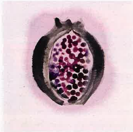
Jade and jasper pomegranate, date unknown. "The forbidden fruit in the Garden of Eden wasn't actually an apple — it was a pomegranate. It's my favorite fruit. My husband gave me this one."