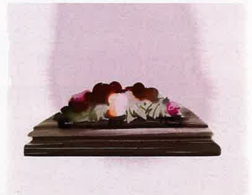
Jade, agate, jasper and rhodonite paperweight, 1800s. "It's a 19th-century piece from western Russia, with stones native to that region. I bought this one myself from the New York City antique shop A La Vieille Russie. I feel it's symbolic of the harvest and prosperity."