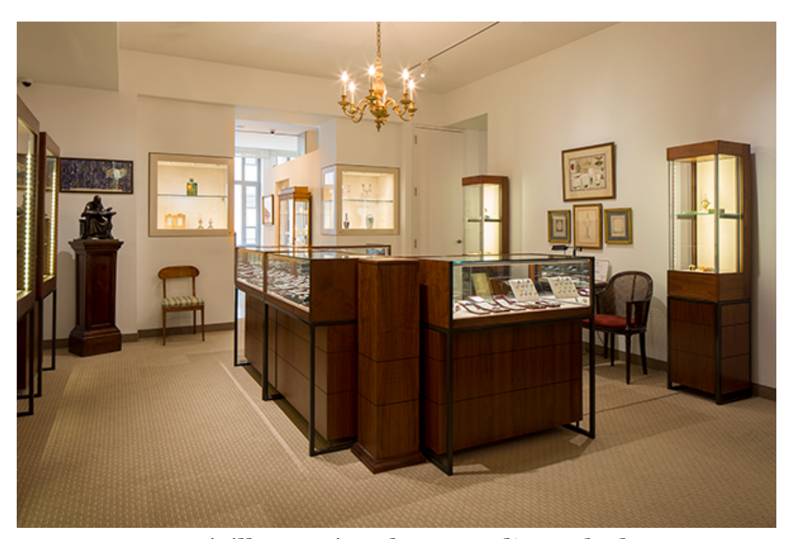
A La Vieille Russie.

The storefront at the southwest corner of the Sherry-Netherland Hotel, at Fifth Avenue and 59th Street in Manhattan, is covered by a construction shed just now. Whatever is built there will seem weird because whatever it is won't be A La Vielle Russie.