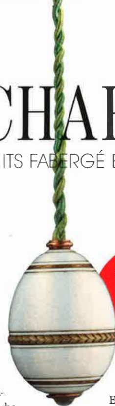
Enamel egg-form hanging bell push, ca. 1915 by Fabergé, St. Petersburg

At the Winter Antiques Show in January, A La Vieille Russie's booth included Fabergé's Impe-