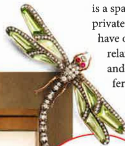
(from left) Victorian natural pearl and diamond necklace, English, ca. 1890, A La Vieille Russie's new showroom, antique diamond and peridot dragonfly pin, English, ca. 1890